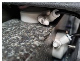
Granite & Air bearings